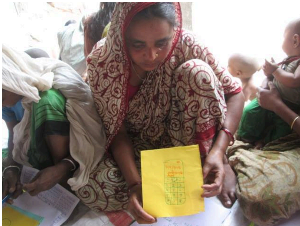
Adult learner showing her writing skills

Azad India Foundation believes that when women are educated, a transformation begins. Education enables women to become central agents of social change, changing the future of their children and their families for the better.