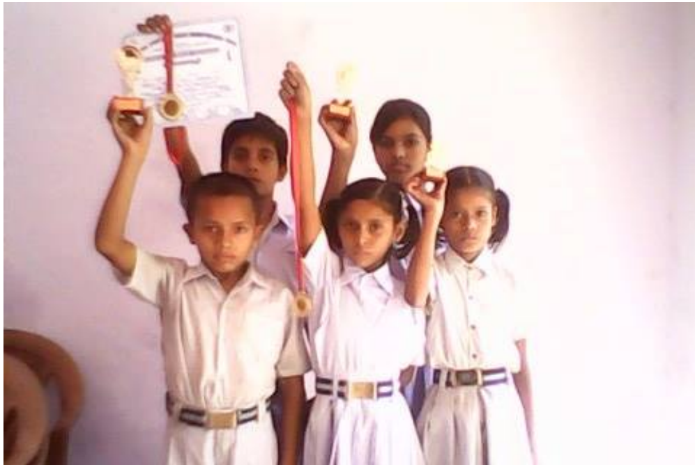
Winners of the District Chess Championship

Azad India Foundation believes that education is the true means of socioeconomic and intellectual advancement of society. Every child, in the least, deserves primary education irrespective of caste, religion or socioeconomic background. APS aims at developing the optimum mental and physical potential of each and every child. The school has introduced contemporary education and training methods to train and educate children in a non stressful and pleasant environment.