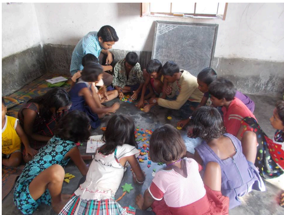
Children enjoying science activity at the Learning Center

The children have varying pace of learning and hence the centres are organized in learning groups that are multi level and multi age in composition. The teachers keep records of children and try to chart out a course of learning suitable for each individual child within the curricular framework. Many activities were organized at the centers.