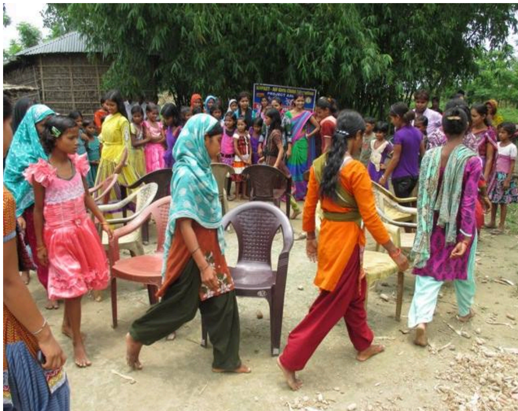
Sports Day at the AIF- IIMPACT Learning Center