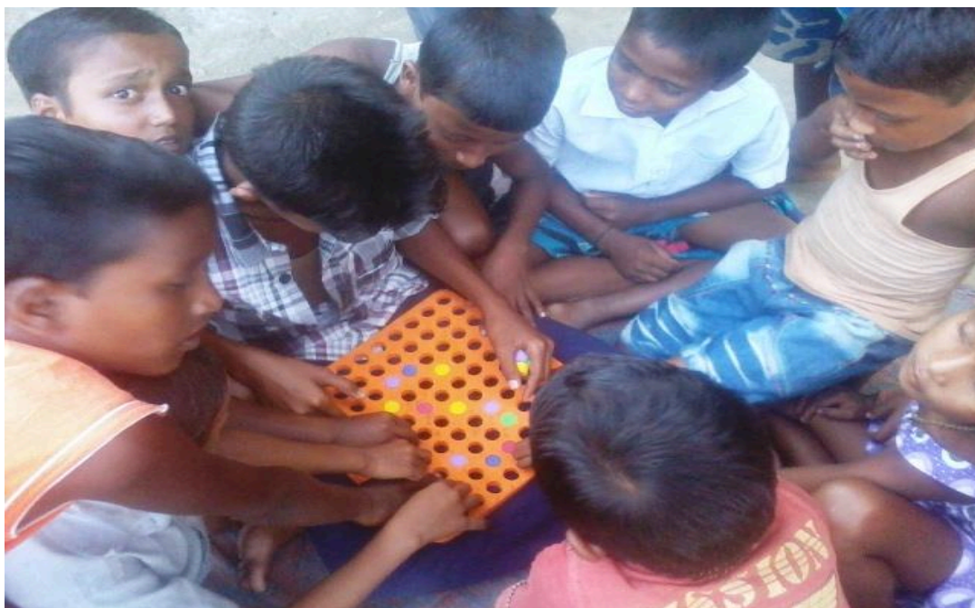
Children enjoying Math puzzle

Azad India Foundation represents an approach to education that emphasizes the development of children's abilities as well as their rational understanding. AIF believes that the main purpose of education is to make the child self – motivated and an independent learner. The Project Talim Phase II ended in March. It covered 50 madarasas and 38 government schools. The main focus of this phase was to ensure quality education to children studying in madarasas and admitting them to the formal schools.